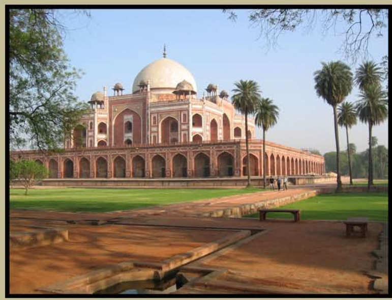
Humayun's Tomb gardens; Delhi, India 💎